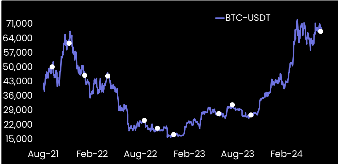
Exhibit 2: Previous Trading Signals